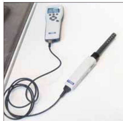
CO 2 air exchange testing equipment

Our quality management team now regularly carry out CO 2 air exchange testing of cases at final assembly stage in our factory and on-site as part of our formal handover procedures.