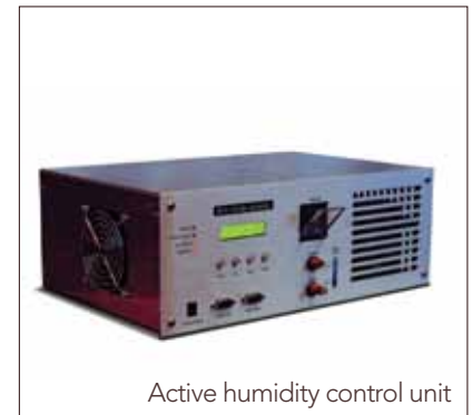
Active humidity control unit

IT CAN TAKE SEVERAL DAYS FOR THE ENVIRONMENT WITHIN YOUR CASE TO STABILISE, PARTICULARLY IF IT CONTAINS WOODEN OR ORGANIC EXHIBITS WITH LARGE VOLUMES